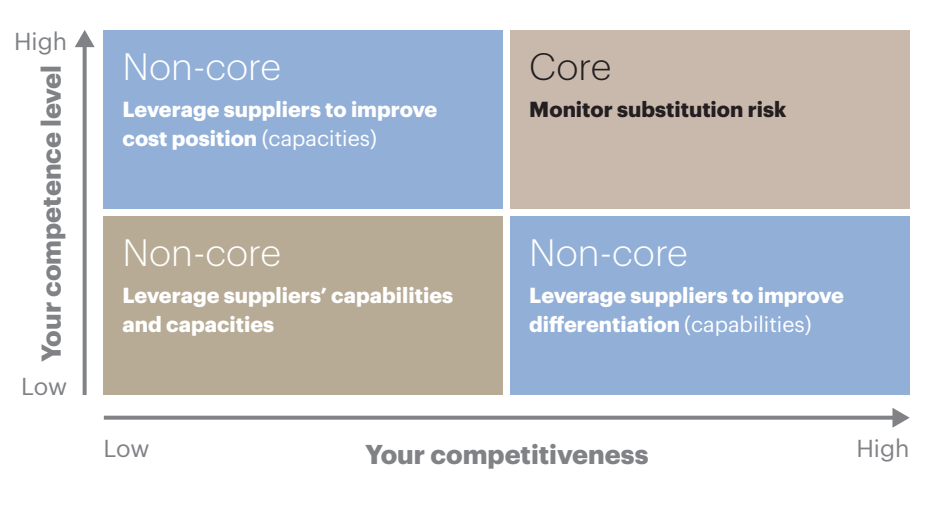
Figure 2 Determine supplier role in your core and non-core capabilities

Pressure to significantly reduce R&D costs while at the same time improving innovation performance is akin to squaring the circle. Here, it is important to first get your priorities straight. Clearly define core and non-core activities and outsource a select number of non-core activities that are not crucial to achieving your innovation goals. A simple two-by-two matrix can be used to break out activities and determine which can be handled in-house and which can be delegated to select suppliers that provide needed capabilities more economically or effectively than can be achieved internally (see figure 2).